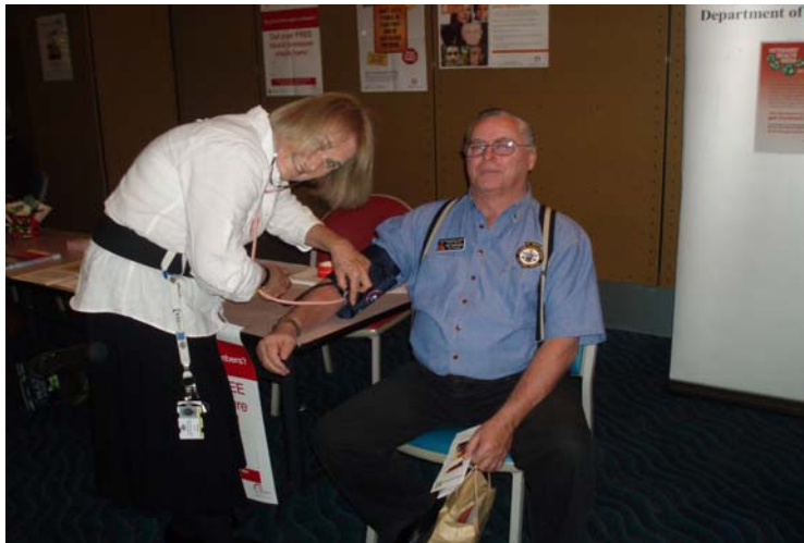
UWE Getting his Blood Pressure checked

Some shots of the VHW