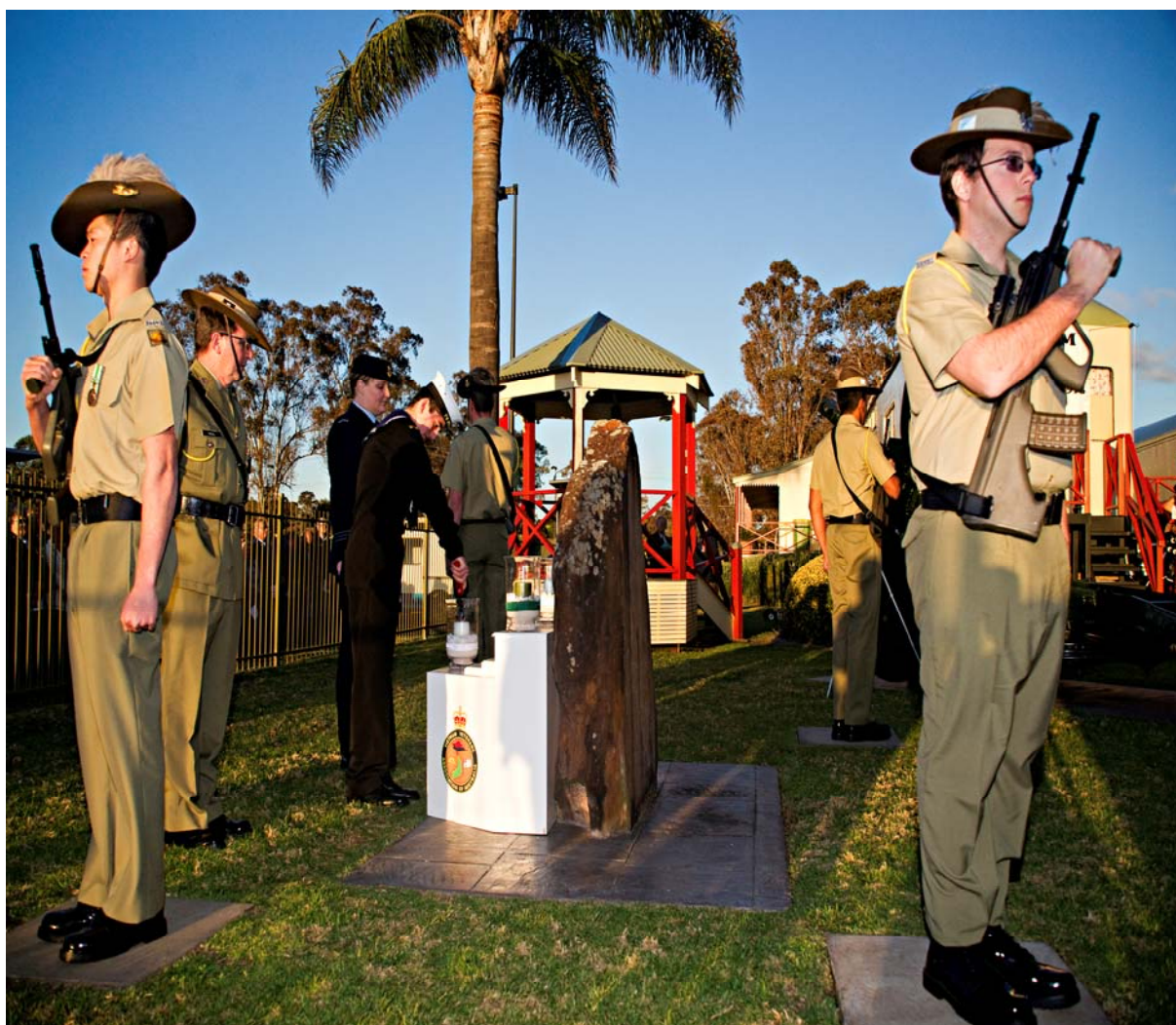
Vietnam Veterans Day 18th August 2011