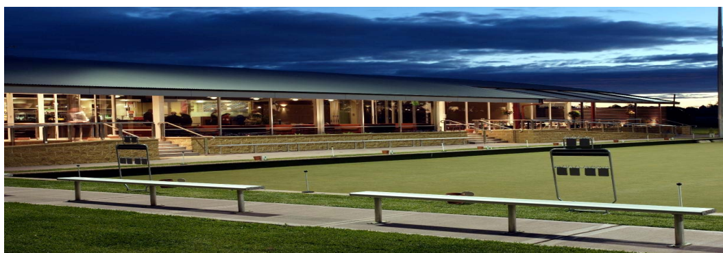
Bowling Club Greens and Function area.

Contact the Bowls Office via Club Reception on 9623 6555