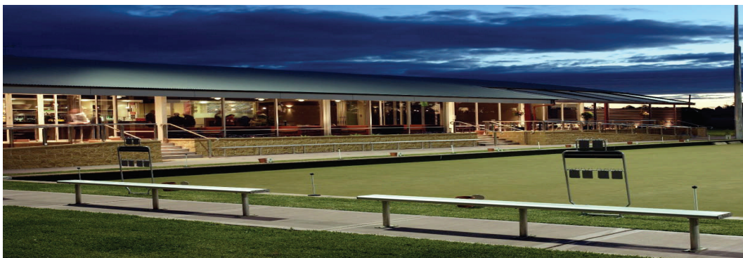
Bowling Club Greens and Function area.

Contact the Bowls Office via Club Reception on 9623 6555