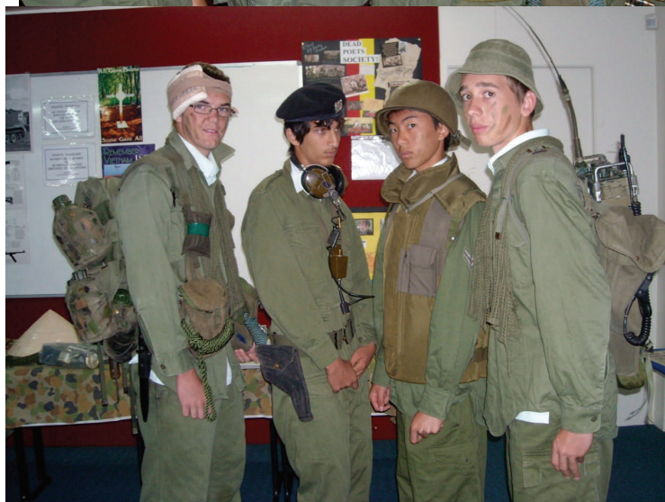
The Outpost E-Team have a wide range of memorabilia donated by members