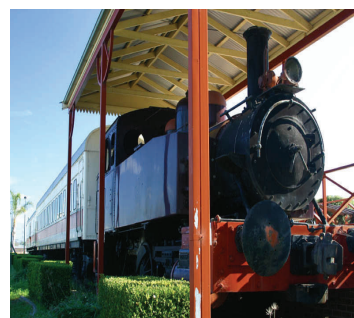
St Mary's Outpost the 'Train of Knowledge'