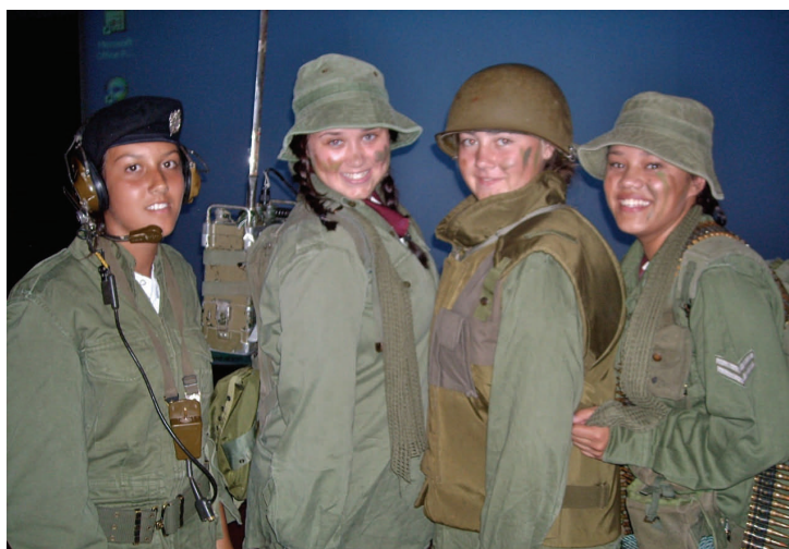
School children in the “Dress Up” Phase of the Presentation.